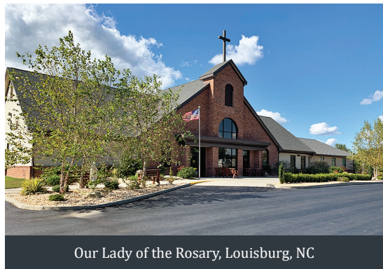
Our Lady of the Rosary, Louisburg, NC

"Each of our schools and parishes sit on land that was preserved through the vision and generosity of others who invested to grow the Catholic faith in North Carolina.